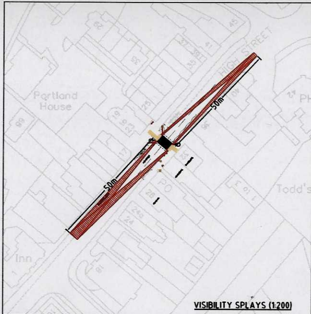
VISIBILITY SPLAYS (1:200)